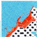
Tangier Med GPS: 35.892770, -5.495829