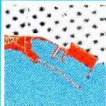
Motril GPS: 35.791752, -5.800045