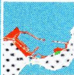
Ceuta GPS: 35.895673, -5.322789